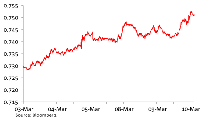
AUD/USD - past week