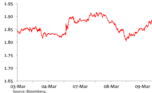
US 10 yr - past week