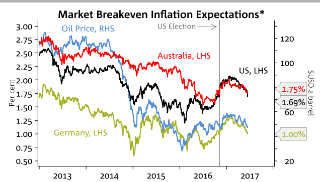
Chart: Oil weighs on inflation breakevens

* Implied by the difference between 10-year nominal bond yields and 10-year inflation indexed bond yields Source: National Australia Bank, Bloomberg