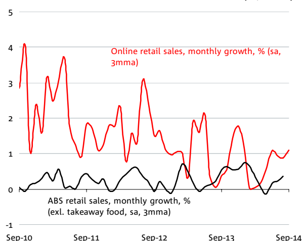
Growth in Online Retail vs. ABS Retail Sales (% mom)