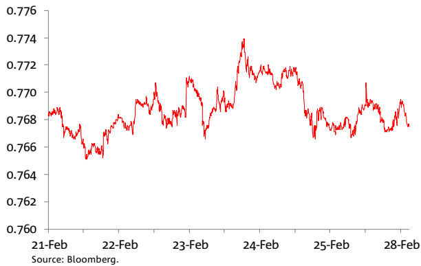
AUD/USD - past week