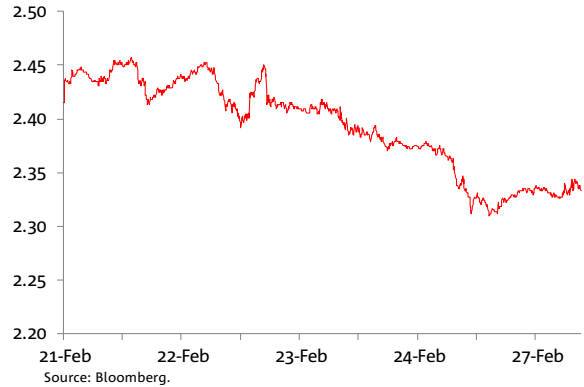
US 10yr - past week