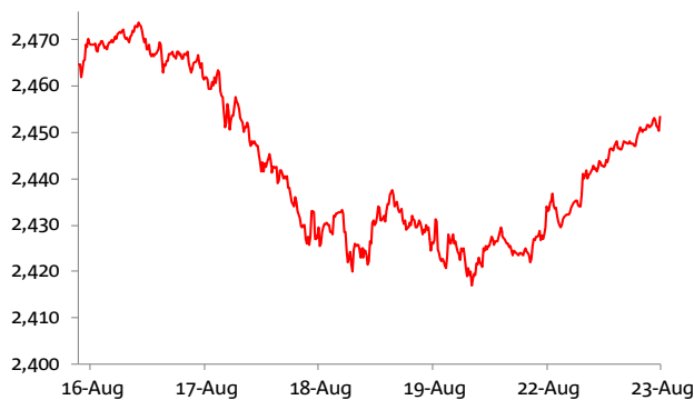
S&P Future - past week