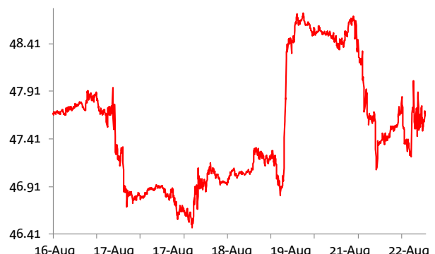
WTI - past week