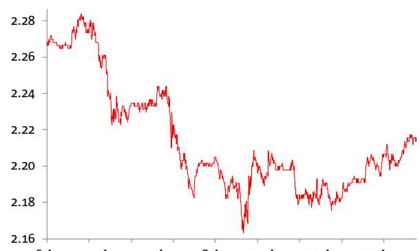
US 10yr - past week