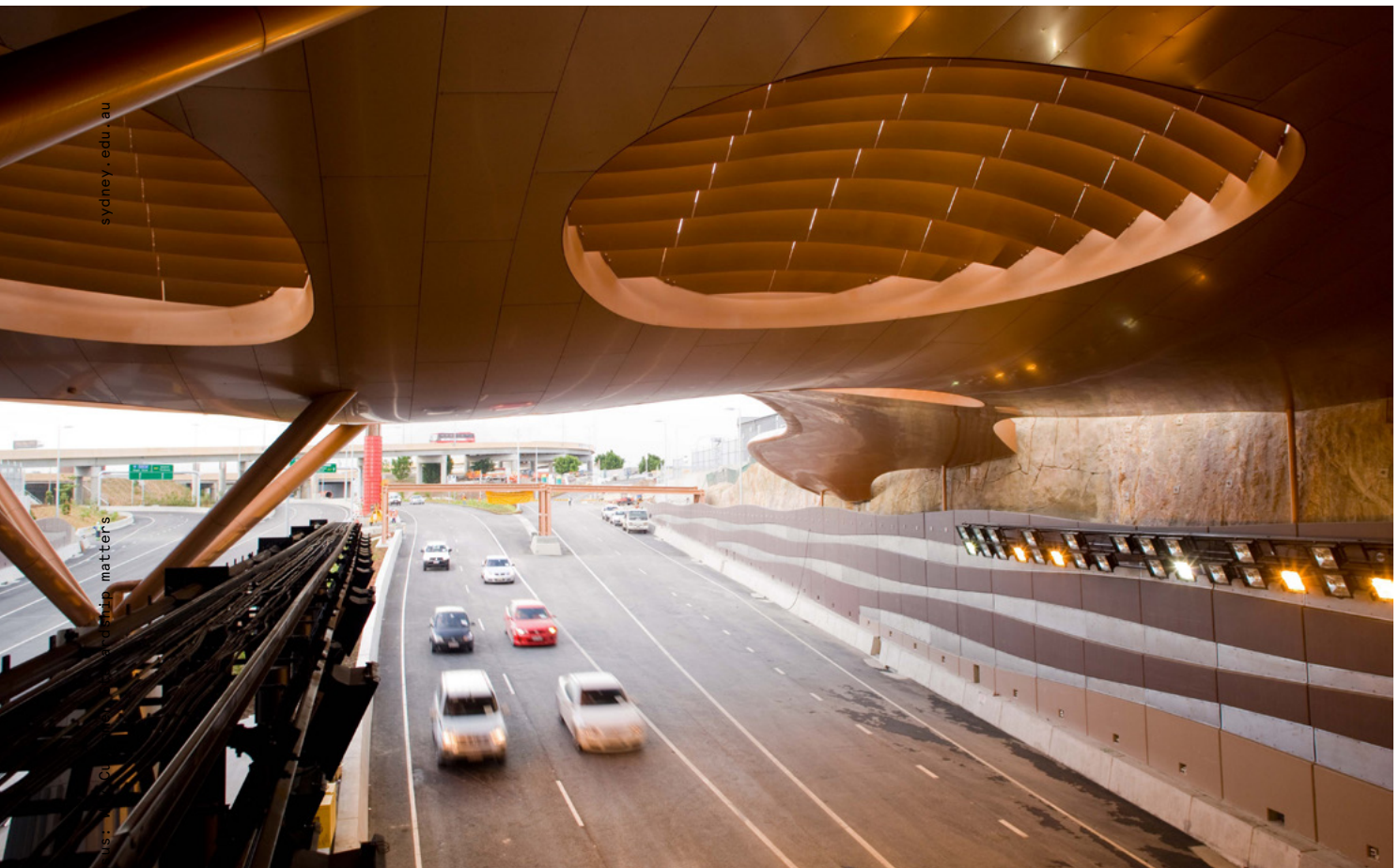
Clem7 is a bypass road connecting Brisbane's inner north suburbs to the southern and eastern suburbs.